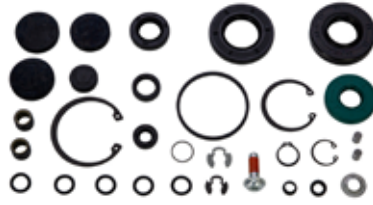
HYD73239 Genuine Hydro-Gear Seal Kit ZT-3400 Standard Pack: 1