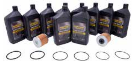
HYD72881 Genuine Hydro-Gear Oil Service Kit ZT-4400 & ZT-5400 Standard Pack: 1