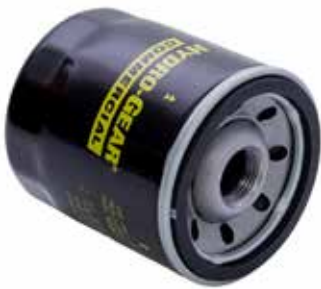
HYD51563 Genuine Hydro-Gear Spin-On Filter Standard Pack: 1