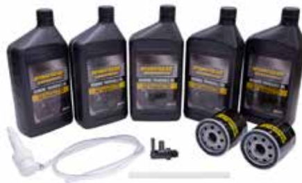
HYD72750 Genuine Hydro-Gear Oil Service Kit ZT-2800 / ZT-3100 / ZT-3200 / ZT-3400 / ZT-3600 / ZT-3800 Standard Pack: 1