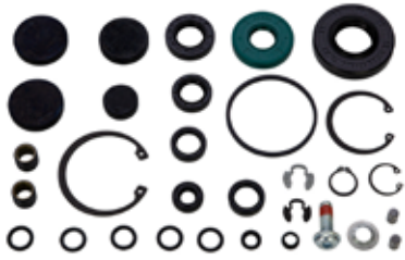
HYD73107 Genuine Hydro-Gear Seal Kit ZT-2800 / ZT-3100 / ZT-3200 Standard Pack: 1

Hydro-gear service and warranty distributor for Australia. Contact our sales team for more info.